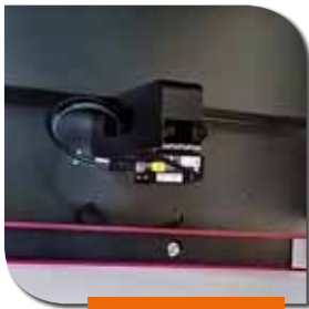
Variable data reader