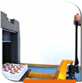
Loading-unloading by pallet